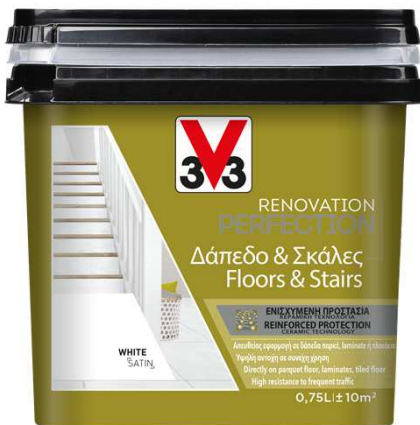
Size : 750 ml